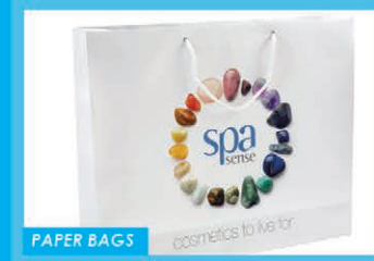
PAPER BAGS cosmetics to live for

DRAYTON CREATIVE DESIGNS INNOVATIVE IDEAS FABULOUS RESULTS