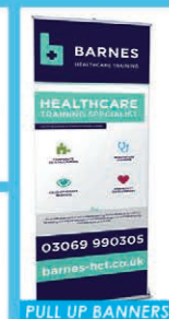
PULL UP BANNERS