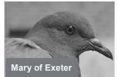
Mary of Exeter

Some pigeons were even packed securely and dropped by parachute to resistance workers behind enemy lines. Usually trained to return to a particular place these birds had to learn to return to different locations. Many birds were killed or injured in the line of duty and one of these was Mary of Exeter. Despite being wounded three times she still carried her message home. She had part of a wing shot off, was attacked by a German hawk and had three fragments removed from her body. She was eventually awarded the Dickin Medal, which is regarded the animal VC, and is buried in a PDSA pet cemetery in Ilford.