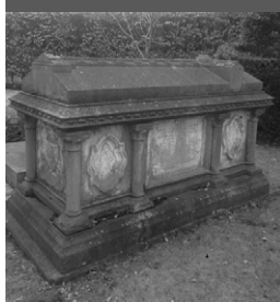
The grave chest of Jean-Sylvain Van de Weyer