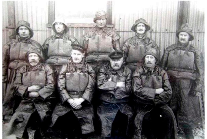
Crew of The Sir Fitzroy Clayton