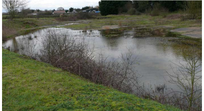
The proposed site ... and just on the other side of the Fifield Road water does not naturally drain away.