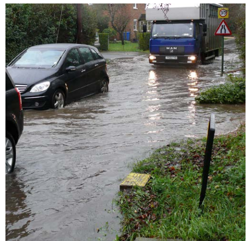
The Environment Agency Surface Water map ... driving past the proposed new site ... and just a bit further south !