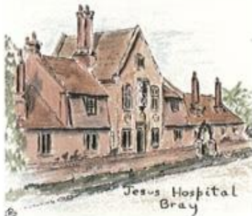
Jesus Hospital Bray

a memorial to those who died and is a busy community centre. Just opposite is the Crown Inn, full of character and low beams which was originally several cottages dating back to the mid 1300's, it has been an inn for over 200 years.